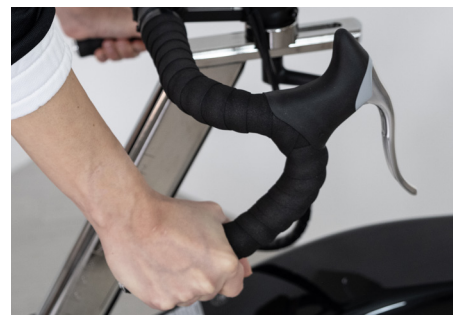
Drop bar handlebars designed for a true racing position