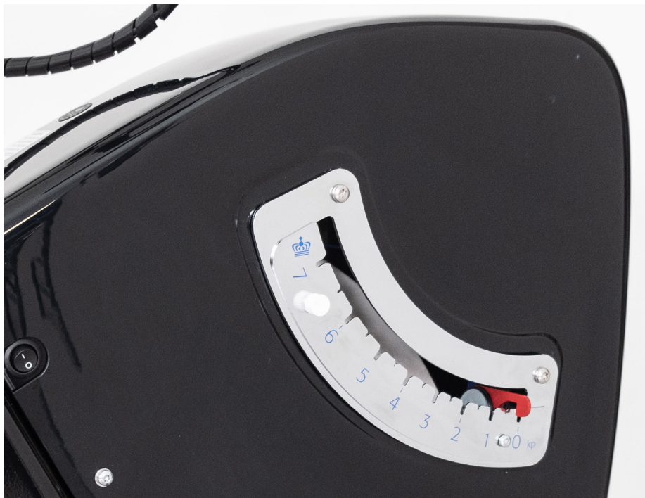
Unique pendulum system allows simple calibration of the bike by means of the kp scale and a calibration weight