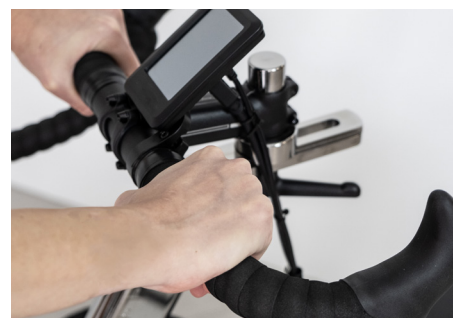
Innovative graphic display for quick and precise adjustment of the resistance and wireless connectivity