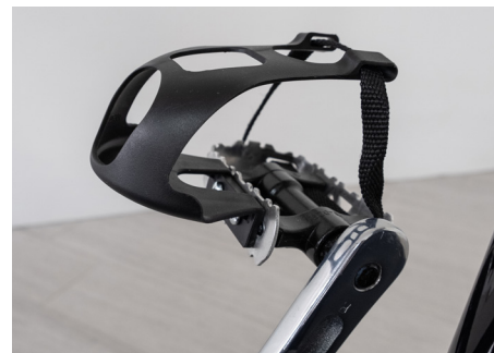
Standard combi SPD pedals with toe clip cage design