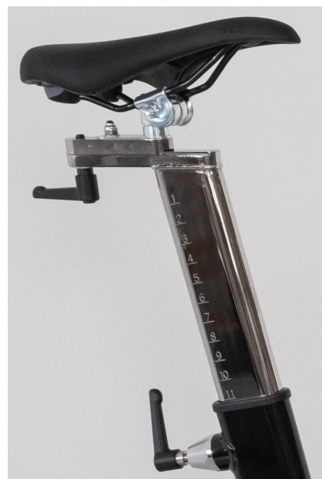
Height-adjustable seat post with rail notch indicators allows unlimited height settings

Use your own saddle, handlebars, pedals, or choose among different options; including a handlebar with gear shifters and sprint button, longer adjustable seat post, adjustable handlebar and mountain bike handlebars.