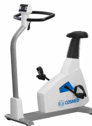
The modular design of the medical-grade ergometer incorporates state-of-the-art technology.