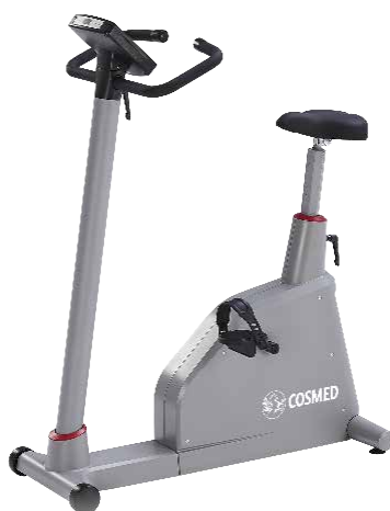
The Optibike Plus ergometer offers a wide range of expansion options.