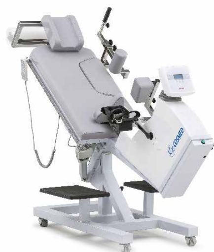
E1200, the classic tilt-recline ergometer for dynamic stress echocardiography examinations.