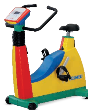
The colorful design of E150 Pediatric relieves children of their fear of the “medical device”.