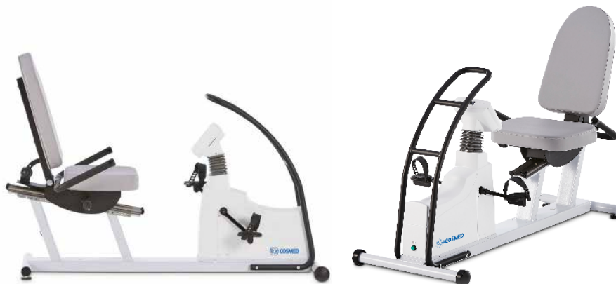
A sturdy support bracket made of tubular steel gives patients a secure hold while moving on and off the E600 ergometer.