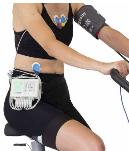
Full interface with COSMED Stress ECG.